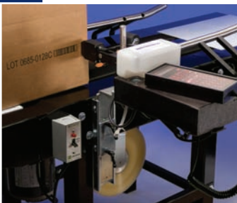
. . . or with hi-resolution printers for printing bar codes, logos and high resolution alphanumerics.