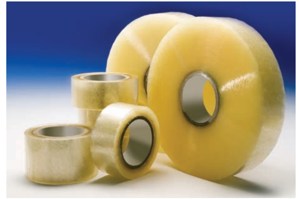
EZ-Tek industrial box sealing tape offers the durability, versatility and reliability needed in your case taping operation.