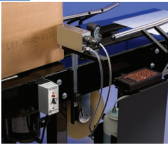
BB-2 can be easily integrated with large character inkjet printers for simple dot matrix case coding. . .